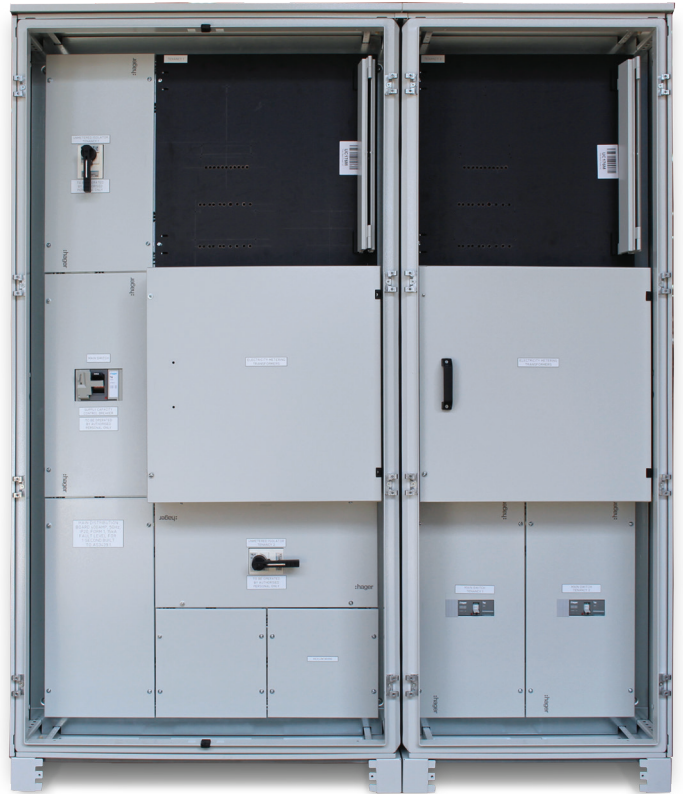
Assembled and unwired meter panel

As the local specialist, we guarantee that the delivered products comply with Australian Standards, State based service installation and local utility metering requirements; and more importantly we deliver an optimised configuration for your building needs.