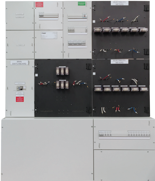
Assembled and wired meter panel and/or distribution devices